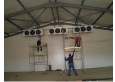
Construction of large Cold Room for Potato Storage