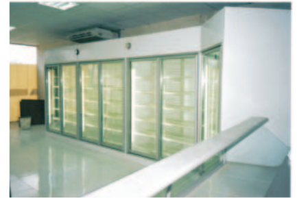
Display Fridges used in food and beverage retail industry