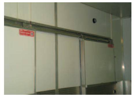
Freezer Room and Cold rooms and Fridge Trailers of various sizes fitted with either Sliding or Hinge Doors